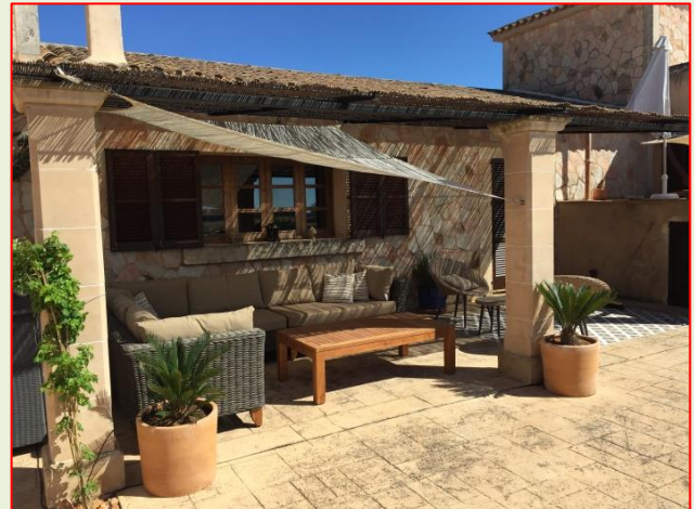
Pool and Outdoor Lounge