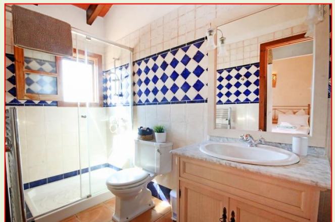
Living and sleeping, bathrooms