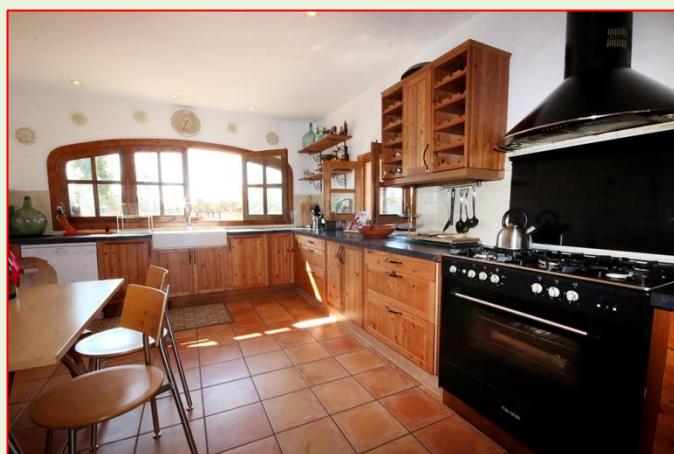
Large dine in kitchen

All 4 bedrooms are equipped with A/C, ceiling fans and mosquito screens.